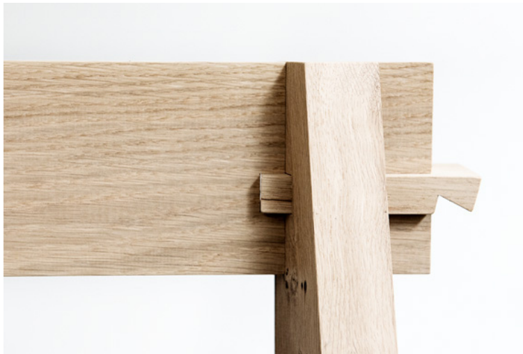
bespoke dovetail joint