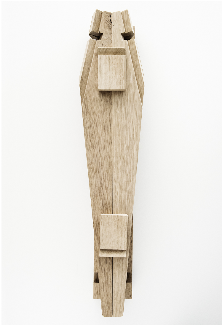
Trestle / disassembled pieces // solid oak