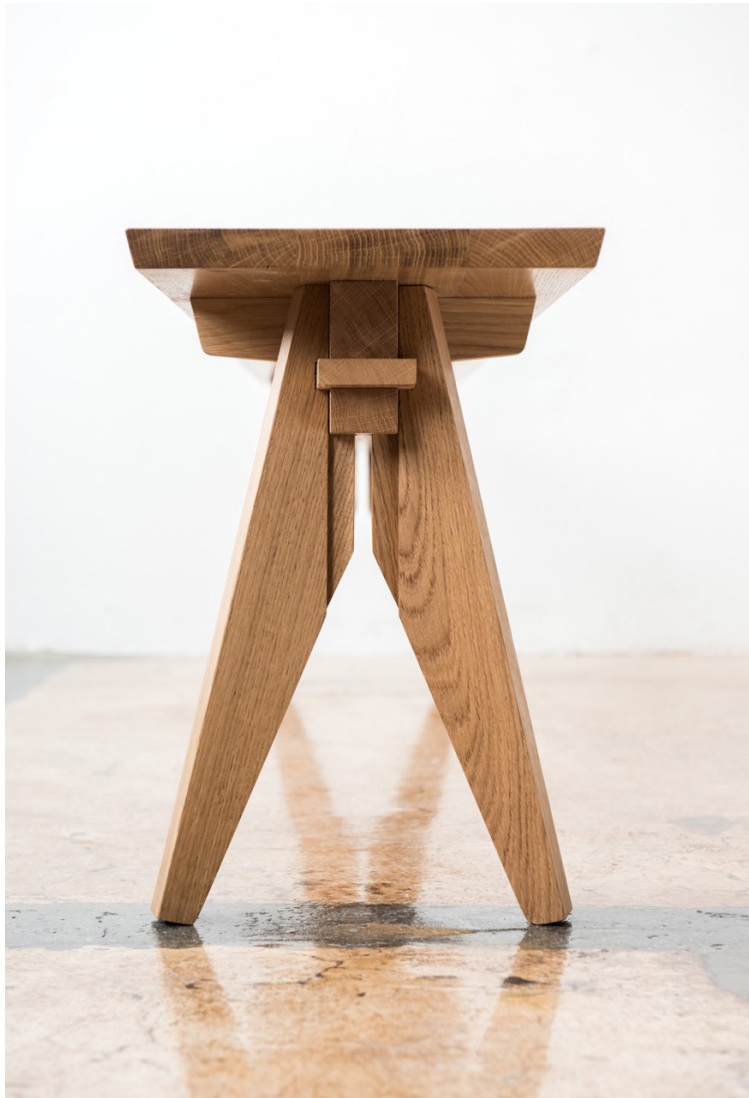
Bench / frontal view and disassembled pieces