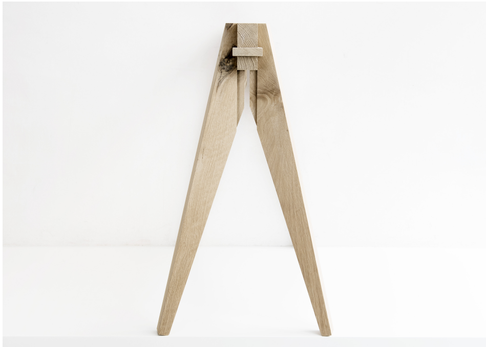
Trestles / frontal and side view