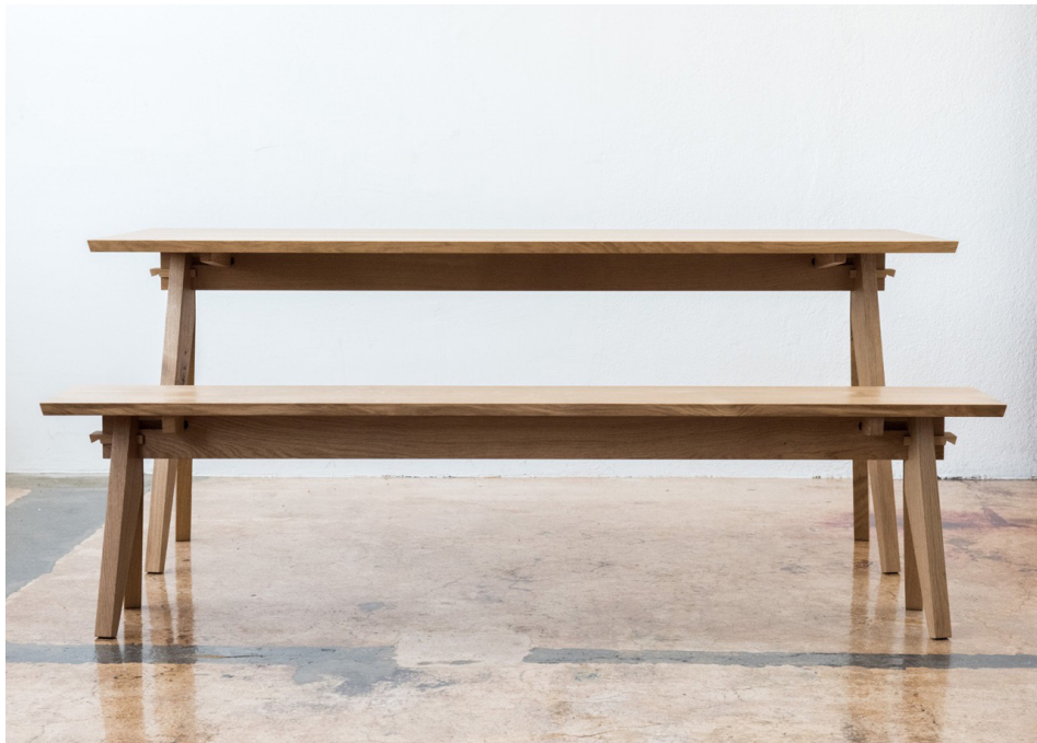
Bench & Table / side and frontal view