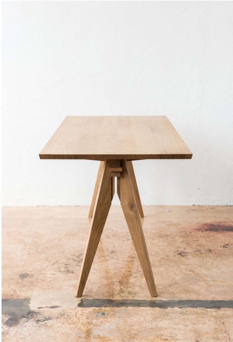
Table / top and frontal view