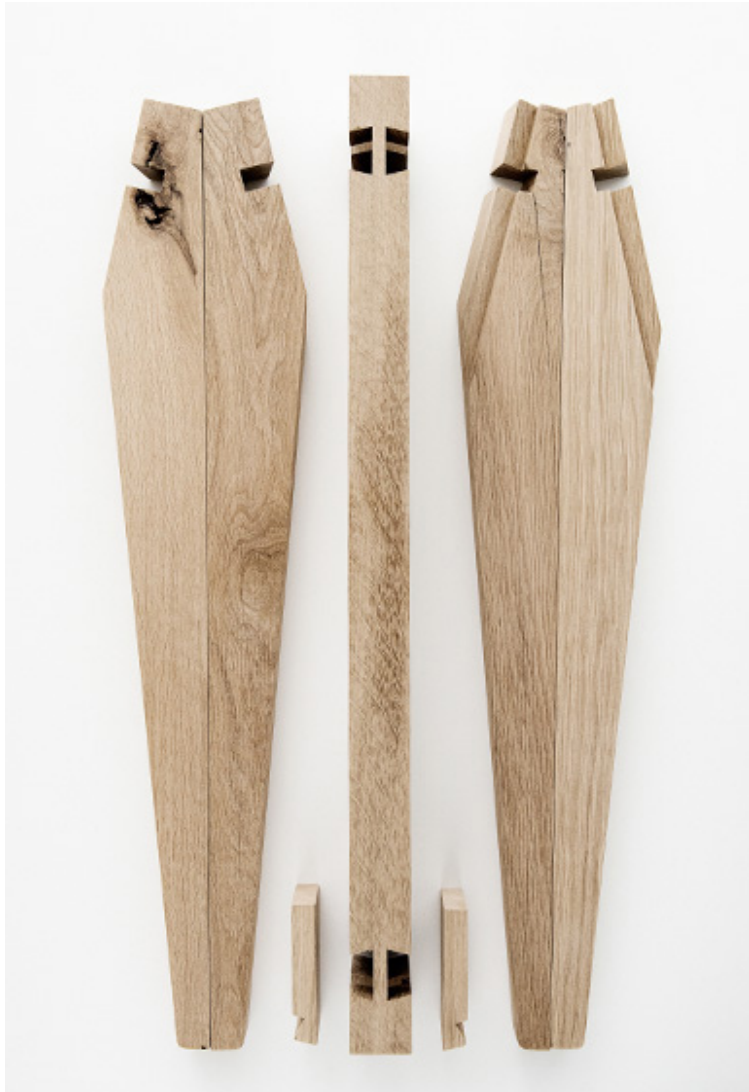
Trestle / disassembled pieces // solid oak