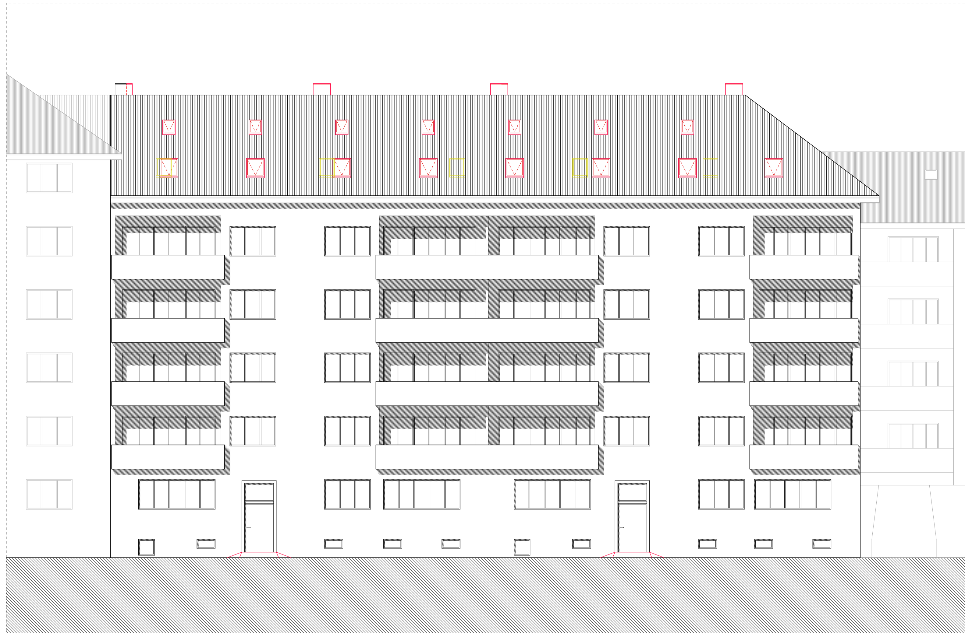
A_001 STRASSEANSICHT 1:100