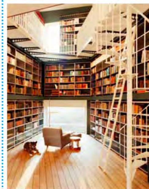
H47* 18' Ilai建筑事务所的建筑项目2010

这种竞赛机制的缺点是公共机关意味着大量的规则和章程,以此来及时确保财政收入。通过这种程序当代建筑工程趋向于变得非常正式、统一。当然也有例外的情况。